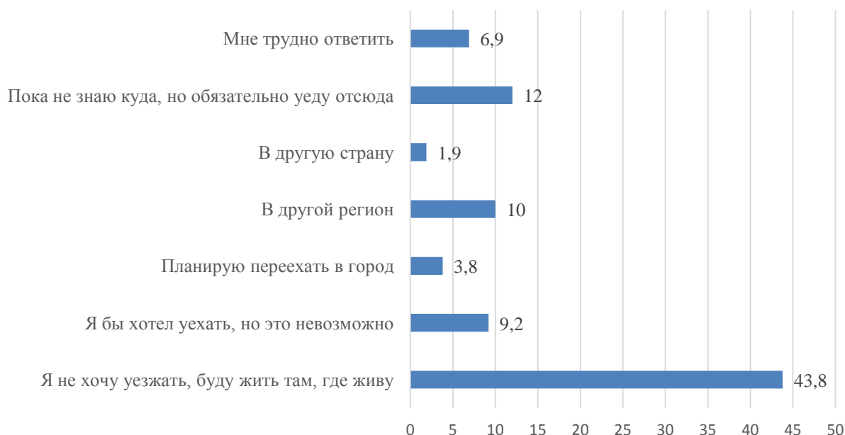
Figure 1 - Migration intentions of young rural residents of Pavlodar region, %

The results of a sociological survey concerning the migration mood (potential migration) of rural residents, in general, confirm the statistical downward trend. From 2000 to 2019, the potential migration of young people from rural areas of the Pavlodar region decreased by 1.3 times, Figure 1.